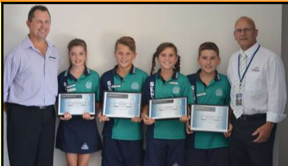
Our school Captains for 2014

NEWSLETTER Term 1 Thursday 20th February 2014