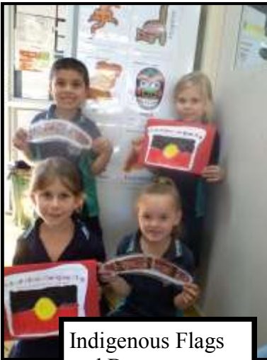
Indigenous Flags and Boomerangs

NEWSLETTER Term 3 Thursday 29th August 2013