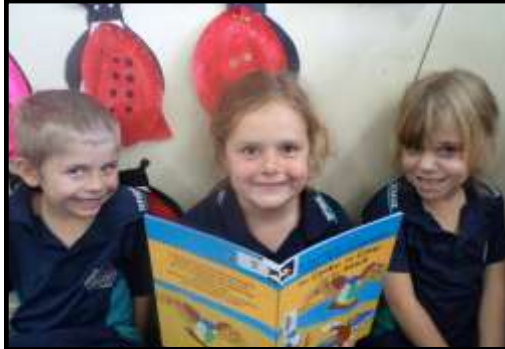
Sharing Dreaming Stories