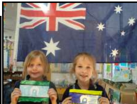
The Torres Strait Island Flag and the Australian flag.